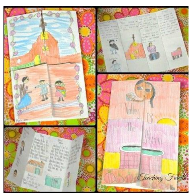
Make a shutter book:

This is a nice activity for your child to show their understanding of elements of the story in a creative way, particularly if they like drawing.